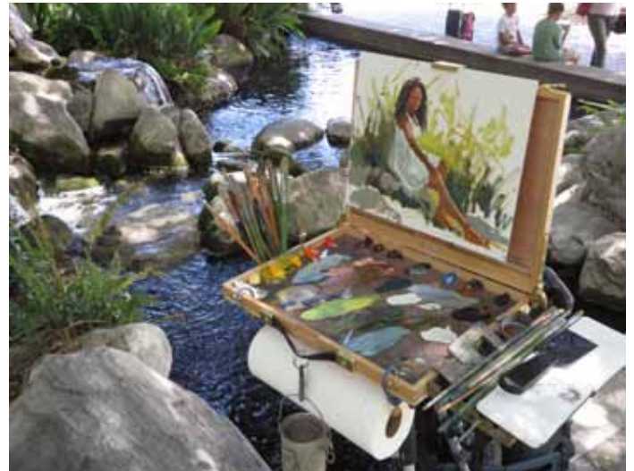
The beautiful Maranatha High School Campus is the location of this year's event.